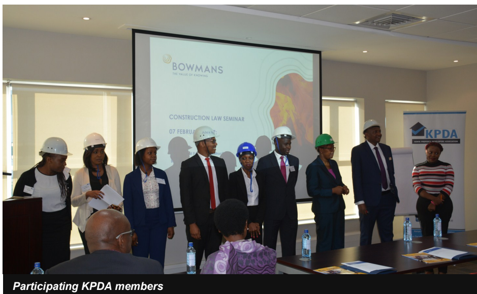
Participating KPDA members